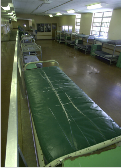
O.H. Close YCF, 2007

These state-of-the-art buildings stand in stark contrast to the dilapidated and archaic 19 th century relics that DJF utilizes to house its remaining wards. Its most modern building, the N.A. Chaderjian Youth Correctional Facility, was built in 1991 using a 270 degree adult correctional model of architecture. The facility is split into 12 prison block units with narrow windows in the upper walls providing the only natural light into the unit and houses youth with mental health needs (Teji, 2010). According to independent experts the DJF buildings have enormous maintenance issues requiring extensive repairs, including but not limited to, the sewer system, plumbing and electrical systems, leaking roof infrastructure, dangerous recreation areas, and a deficiency of programming space (Krisberg, 2009, pp. 14-17). Recognizing that this environment is acutely adverse to the adequate provision of therapeutic services, Alameda Superior Court has mandated that all DJF facilities be replaced at an estimated cost of $1 million per cell before it can be released from the Farrell lawsuit (Krisberg, 2009).