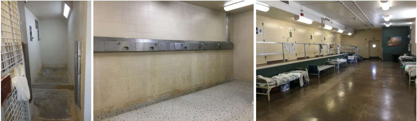
Communal bathroom facilities at DJJ (left, middle). Open dormitory unit at DJJ (right).

We write to urge immediate action to protect youth in the Division of Juvenile Justice (DJJ) where three young people have tested positive for COVID-19 since June 14. Young people are not safe from the virus until the state suspends intake into the facilities and drastically reduces DJJ's population through systematic releases, prioritizing youth who are medically vulnerable or likely to be released within six months.